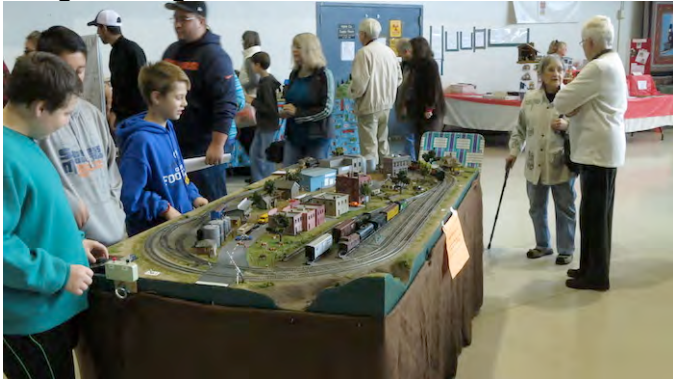
Kids Layout drew quite a crowd