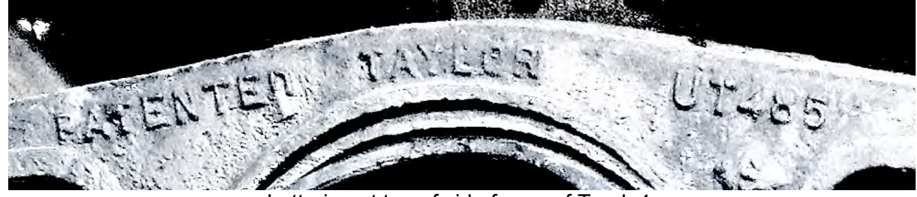
Lettering at top of side frame of Truck 4.

Truck 4 has me stumped. It has a nearly circular interface between the side frame and bolster assembly which should make identification easy. A detailed look at the original photo has the wording "Patented Taylor UT485" across the top of the casting. Any candidates??