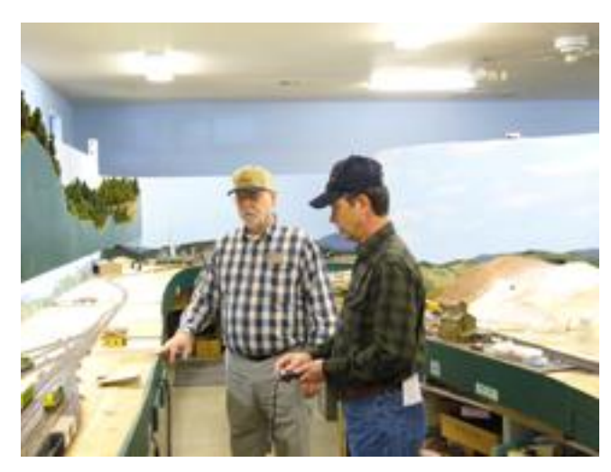
Just like old times