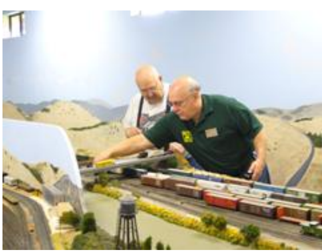
Did you see that bus move!!