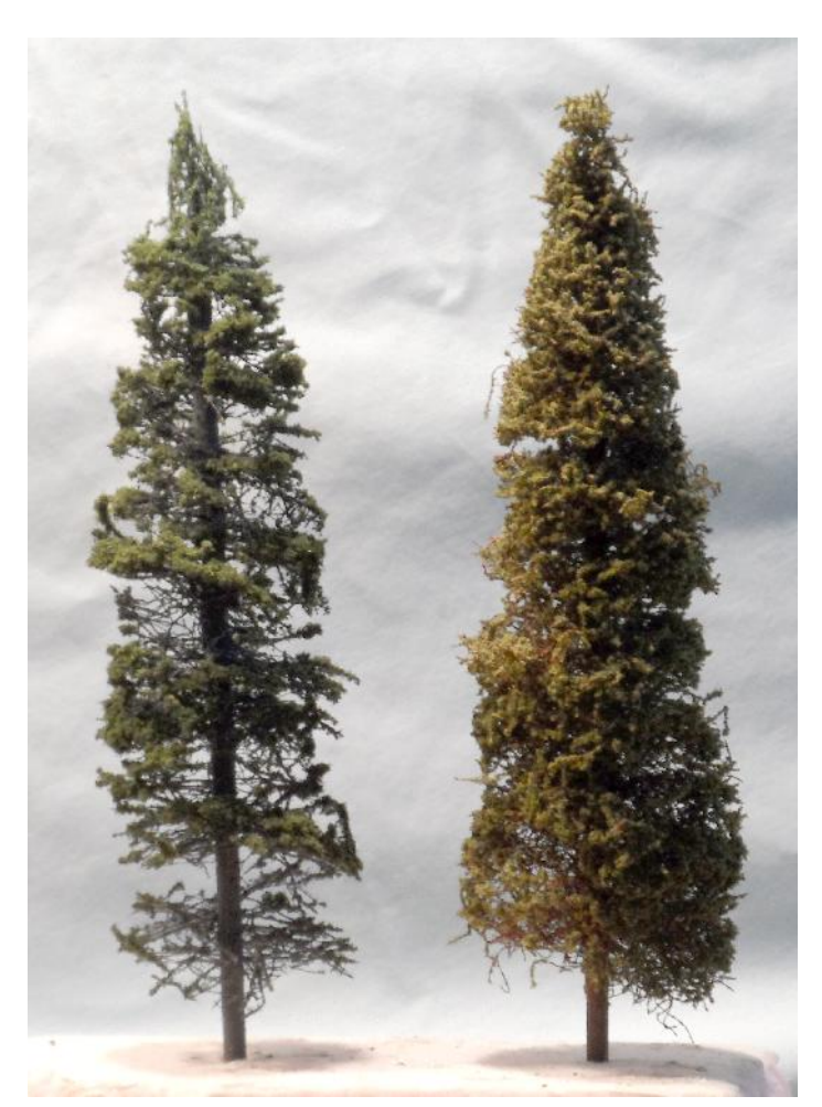
Figure 5 shows a fir and a cedar. The cedar has 5 different layers of colored foam. The key is to look at the real trees and try to match the different shades. The time of day and the season will also affect how the trees look. Trees on a north facing slope will typically be in a cooler wetter environment which will affect their colors. Experiment with different colors of ground foam. It will take several layers to get some depth in the coloring. You can always cover up a color you don't; like. Having a good set of pictures to guide your tree building will be a big help.

Figures 6 & 7 show scenes on the RVMRC near Butte Falls which contains many trees made using the same techniques; but look quite different.