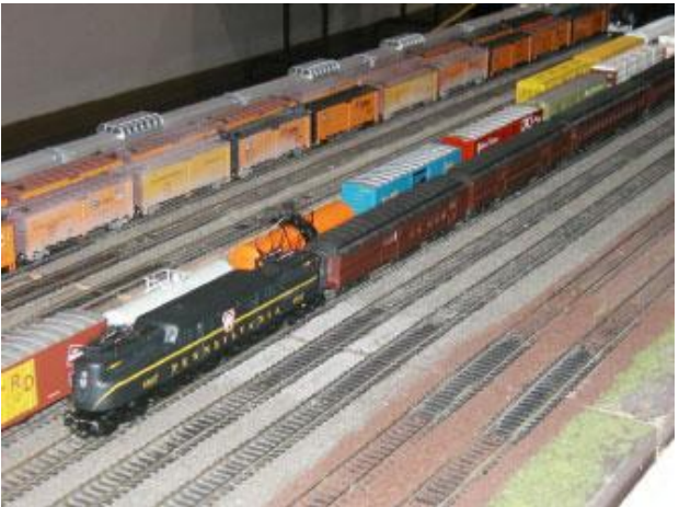
Wil Cleveland Photo