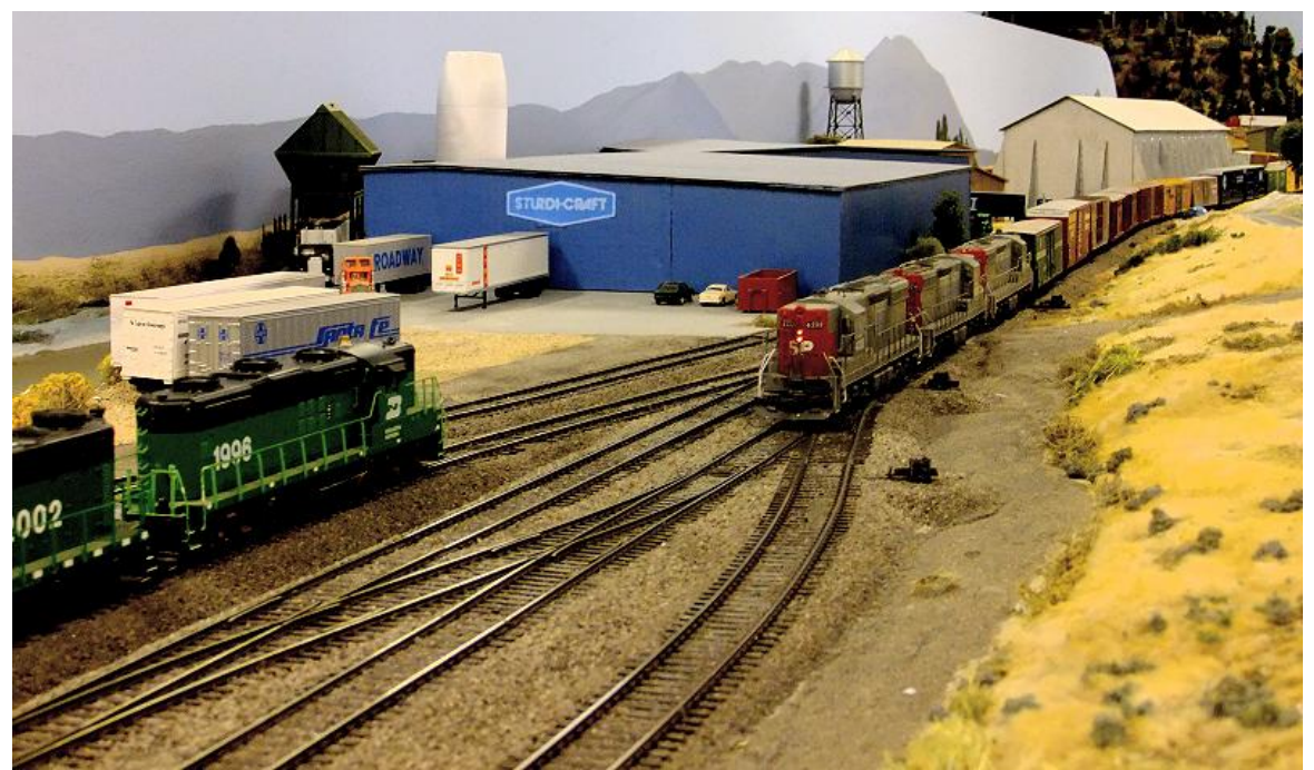
The MEASM gets a quick clearance through Merganser and Pelican Yard, since there's no switching to do and the sooner it gets out of the way, the sooner the Pelican Switcher, on the left, can get back to work.