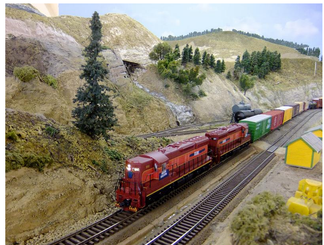
The Butte Falls Turn has completed its switching and is returning to Klamath Falls. In this view, it's just cresting the hill at Summit and starting the long, steep decent to Merganser. Note to MOW Crew: These tracks seriously need some ballast!