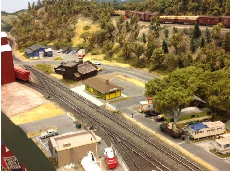
Eagle Point is becoming a real interesting spot to visit