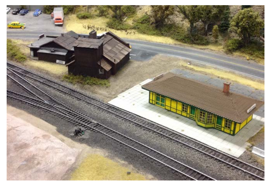
The Train Station and Ed's Oasis are recent additions to Eagle Point