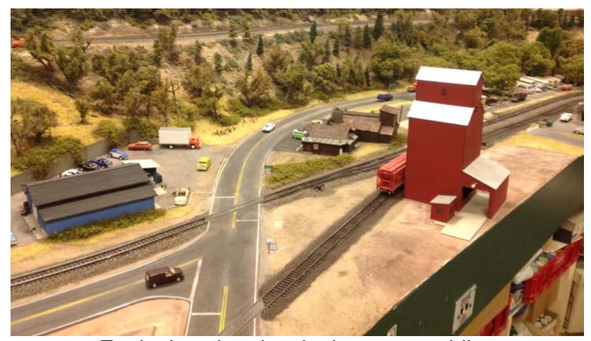
Eagle Junction developing very rapidly

Paul Hendrickson are really leaving their mark. Both structures are based on the real structures with some compression to fit them into the available space. Both were scratch built. The detail on Ed's Oasis is really fine. The main problem is that the front of the establishment, which has a lot of interesting detail, faces the rear of the layout. We'll have to find a way to sneak a mirror into the scene so we can view it. Not that the rest of of the building has a lack of details. The complexity of the roofing is really neat. It consists of simple roofing elements; however, they are combined in a clever way which draws the eye to it, This is topped off with a realistic weathering job. The station is similar to the one in Butte Falls, just like the prototypes. A thank you to Joe DAmato for producing the laser-cut parts. The interesting differences between the two staations are the platform with grass in the cracks and the parking lot, complete with cracks and potholes. You have to get up close to really appreciate the modeling effort. Wonder what is next on their agenda?