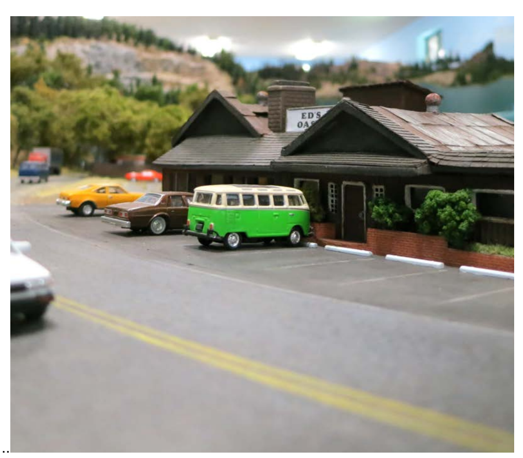
The front of Ed's is full of detail and looks neat. Unfortunately, it faces away from the isle and can't be seen without a mirror (or a camera).