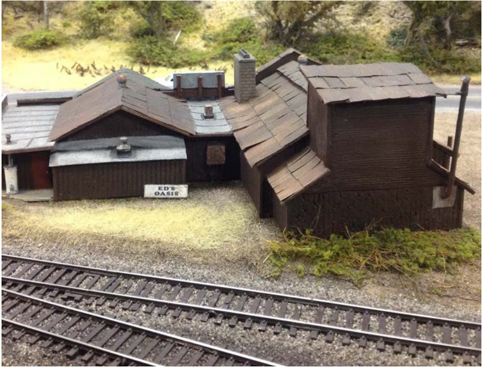
The rear of Ed's Oasis. Note the interesting roof line and weathering