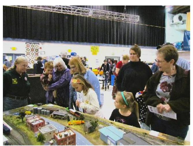
Kids layout is very popular