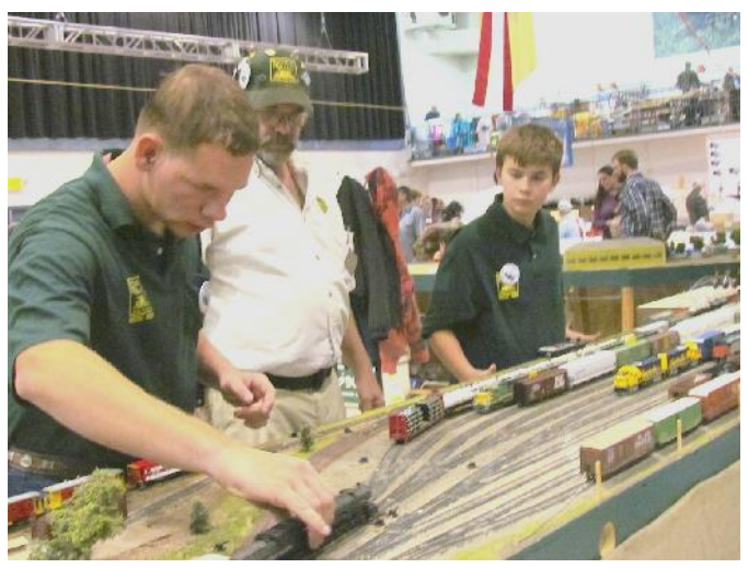
Younger members keep them rolling