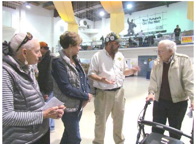
Talking to the public

The 36<sup>th</sup> annual Train Show was held the last weekend in November. Over 3900 people attended the show. Some of the club's newly refurbished modules, especially the truck terminal drew a lot of attention. The fully sceniced 'Kids Layout' was also very popular. The public recognized the club's efforts and voted the club's layouts 2<sup>nd</sup> place in the popular vote for best display/layout.