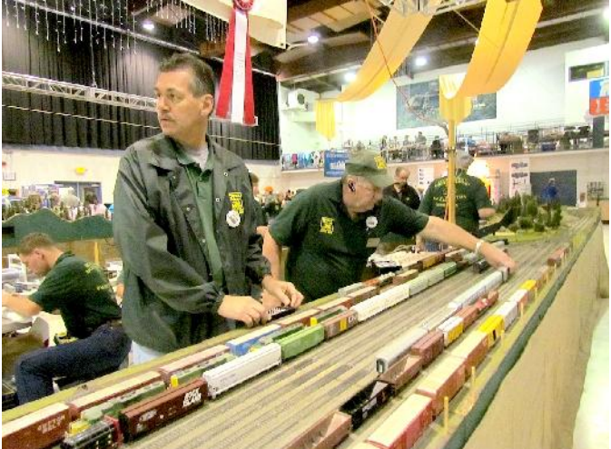
Keeping the trains running