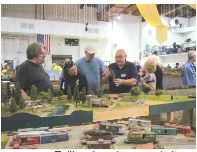
Telling them how we do it