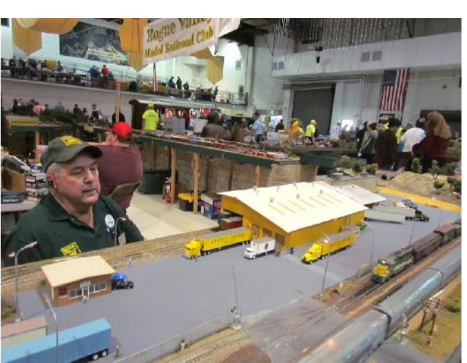
Keep on truck'n at the terminal