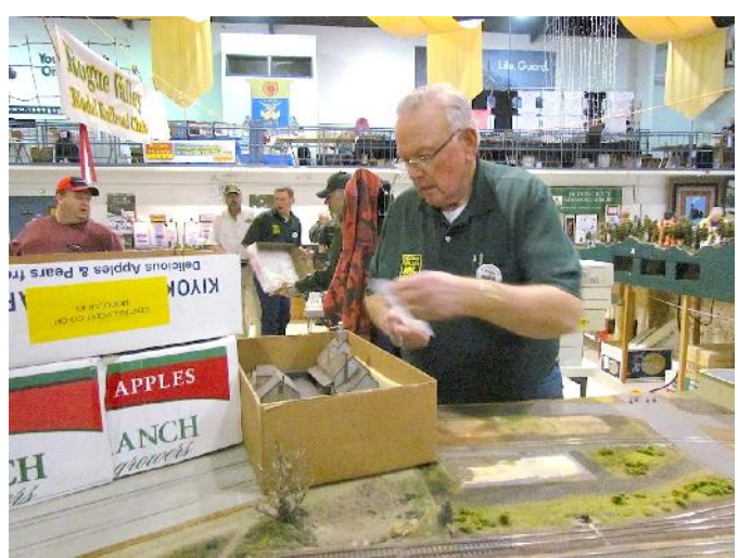
Set up and Break down are a big, but little noticed, part of the effort

RVMRC Passing Track Page 2 of 7 January 2014