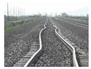
It's a Bad Day when:

Your car runs out of gas when you're driving on the South Side of Chicago late at night... Your car gets stalled at a railroad crossing... You try to lick the third rail on an "El" platform... You find out that you are having a bad day!