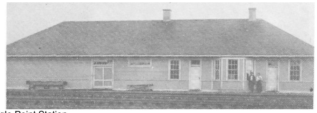
Eagle Point Station (from "Railroading in Southern Oregon" by Bert and Margie Webber, published by Ye Galleon Press)

The Butte Falls station photo is an end shot which shows the general layout but is not suitable for determining dimensions (except of the one end of the station). The photo of the Eagle Point station is a straight on shot which is perfect for working up a drawing. Seems the original P&E