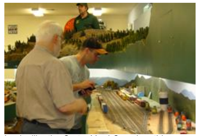
Looks like the Crater Yard Crew has things pretty well cleared out.

On June 16 the club hosted an operating session with members of the club in Eugene. It is fun to see how other railroaders react to the challenges of operating the P&E. Most of their members paired up with a club member to make it easier to find their way around the layout (and find their train after it had poked into a tunnel). We think the Eugene crew enjoyed the challenges presented to them.