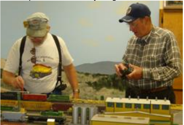
Teamwork is important