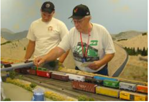
The Pelican Yard Crew is keeping busy