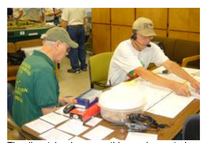
The dispatcher has everything under control