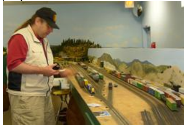
A bit more work to do in the BN & SP yards