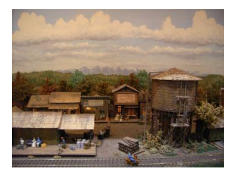
Campbell Scale Models Diorama

Other crowd-pleasers included two award-winning dioramas created by Dick Hotchkiss (Merlin, OR) featuring G-scale trains, and a display of railroad-themed quilts from the Jacksonville Museum Quilters.