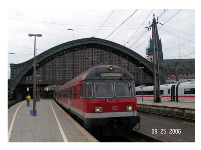
One of our trains at Köln Bf

I went for a three week trip to Germany and Ireland. The German transportation system is great with buses and trains running on time! Don't stop for a pit stop or you may be waiting for the next one.