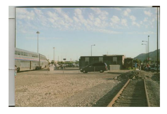
Compare and contrast...Amtrak's Salt Lake City station and its counterpart in downtown Denver.

The beauty of being late, however, is that one traverses track that is normally traveled in the dark of night. Such was the case leaving Salt Lake City and up the Spanish Fork canyon. Even a porter was marveled by the new found scenery normally not seen. During one of our winding climbs up the canyon, I was able to look forward ahead of the engine and watched a moose scramble up a steep bank just as the lead engine arrived. I had no idea moose were even in Utah! As I found out later, many Utah moose have been transplanted to Rocky Mountain National Park, where moose sightings are becoming very common and enjoyable, to say the least. Besides the moose, I started seeing an abundance of pronghorn antelope.