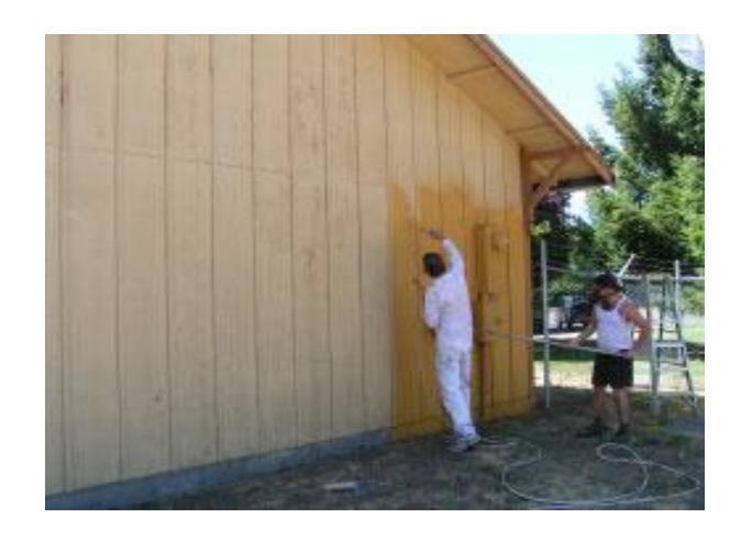
A glossy UP yellow now adorns the building. The glossy more accurately resembles the lead-based paint that historically covered UP buildings.