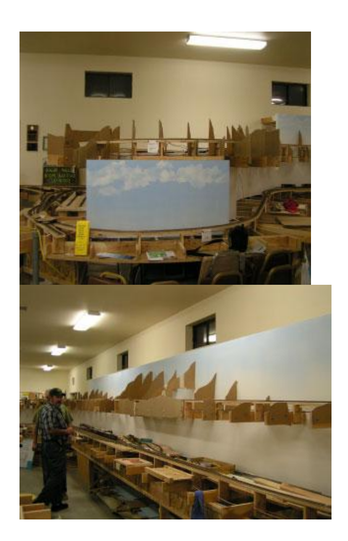
Ben Vander Veld completed painting on the Clubhouse August 20. The Club raised nearly $1,000 to help offset the approximate $2,000 bill for painting the building.

Bruce, John Wilson, Wil Cleveland and others experimented with some blue sky and clouds on the upper stretch of the line over the Cascades. Brown cardboard mockups of scenery contour lines add to the visualization of the mountain scenery and blue, cloudy sky. Saturday's (September 11) planning session was postponed, but the group present did spend several hours experimenting with various sets of lights for mounting underneath the upper level to light up Crater Yard and Agate. The group settled on a 16 inch fluorescent type light that emits beautiful natural looking light without casting shadows. The group further agreed upon an installation scheme. Brad and Jay then proceeded to install several of the "rejected" bulbs above the hidden staging yard on the east end of the layout.