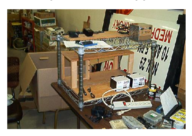
Jay Mudge has fashioned metal shelf housing units to hold DCC power booster and other control units.

Four of the "Sypac Five" (from the New Years op session on Larry Tuttle's Siskiyou Pacific RR) descended on the Club's layout to jumpstart the DCC wiring. Dave, Jay and Larry, armed with assorted drills, assaulted the upper level loop and drilled pairs of holes in risers supporting the track. Next, 12-gauge black and red-sheathed bus wire was laced through these holes and around the loop. After lunch, the gang stripped insulation from spots in the bus wires and the stripped ends of the feeder wires wound around. Finally, Jerry (who was escaping from the weather) soldered the wires together, while Dave cut gaps at each end of the sidings and mains between turnouts so as to prevent shorts. On Saturday, after cutting gaps to insulate frogs on certain switches, the first P&E train rolls along the upper level via DCC. We can still run regular DC or DCC because the upper loop is wired only to one feeder. Wire screen metal shelves, which were stored outside, will be used to support the power supplies and boosters under the layout while allowing free airflow around this equipment.